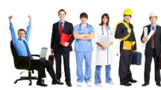
Getting a Job